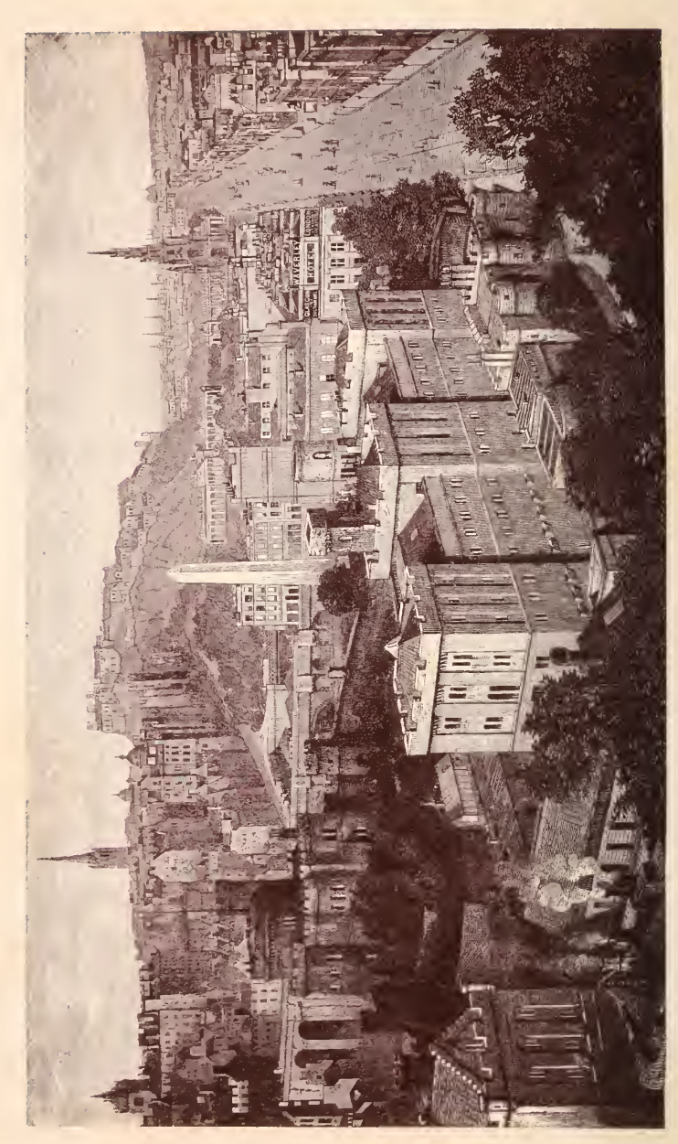
BIRD'S-EYE VIEW OF THE CITY OF EDINBURGH FROM CATON HILL Scotland, vol. one.