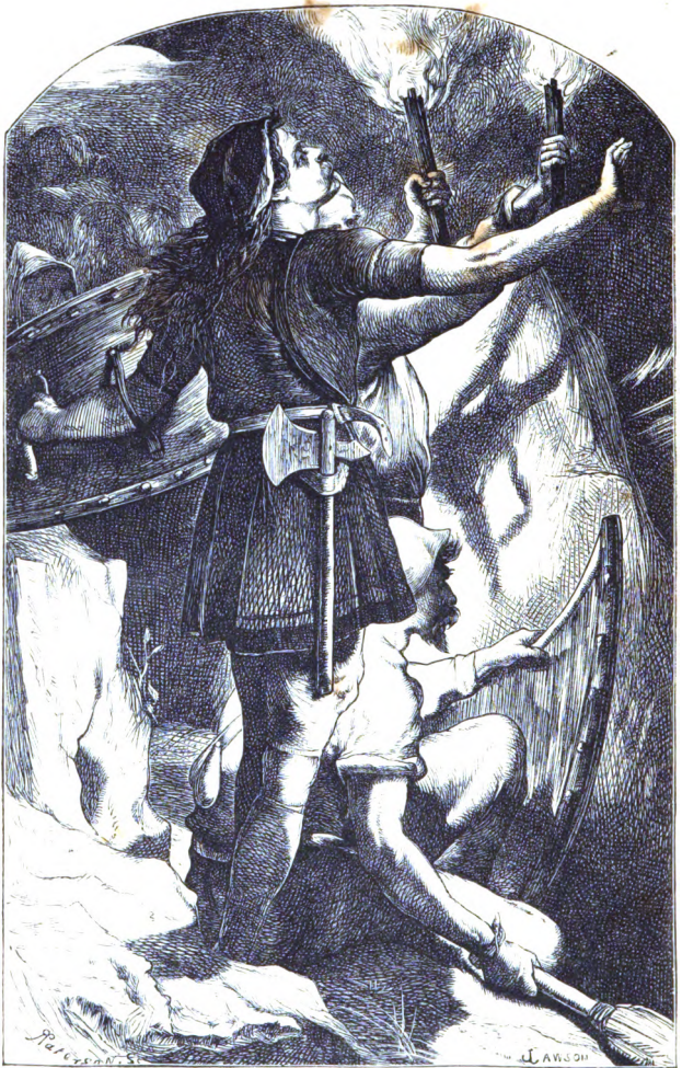
LOOKING FOR THE NORWEGIAN FLEET.