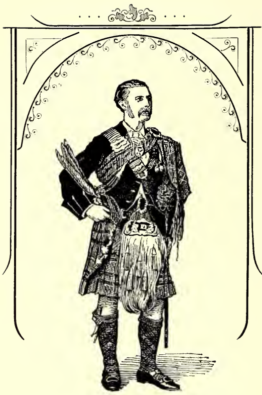
SIR FITZROY DONALD MACLEAN, BART.