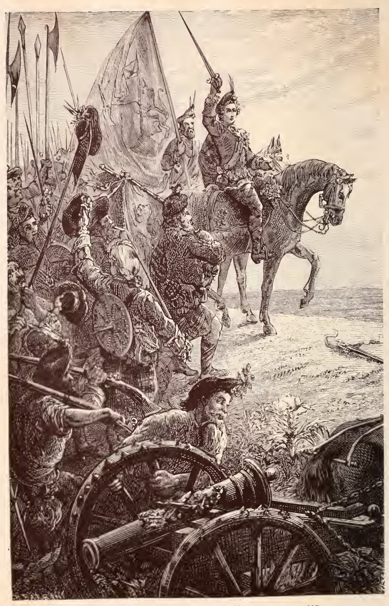
LANDING OF THE PRETENDER IN SCOTLAND Scotland, vol. two